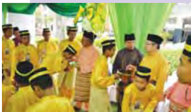
Hari Raya Bersama Rumah Pengasih Warga Prihatin