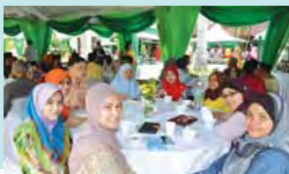
Theta's Health Program